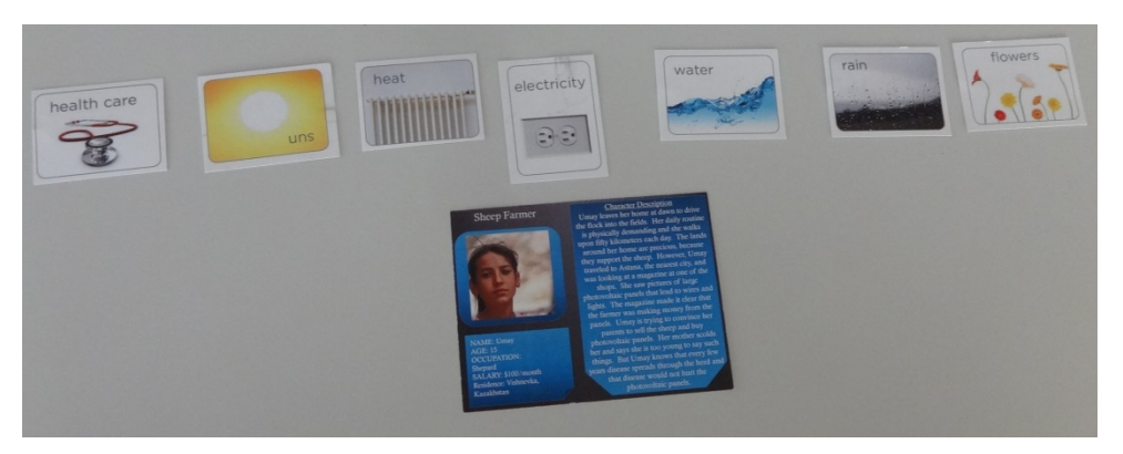
Figure 7: Representative results of one participant's prioritization of environmental impact categories presented graphically as Values Cards.