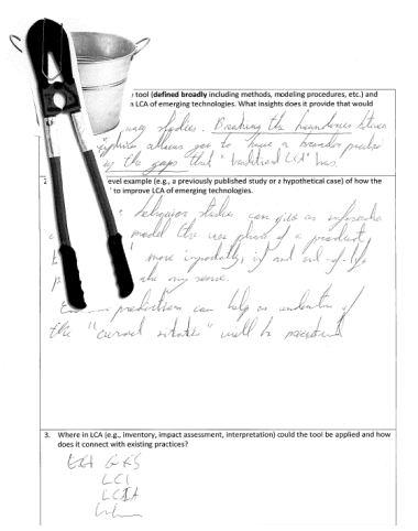
Figure 6: Example worksheet and affixed tool image.

The workshop organizers also cut out an assortment of images including office supplies, craftsman tools, toys, small machines, and vehicles. In-workshop execution began with all pictures spread across a table while participants brainstormed a tool they are familiar with. Participants were instructed to select an image that caught their attention and represented their tool metaphorically. Participants spent ten minutes answering the preceding questions, and then affixed the image to the worksheet with tape, as shown in Figure 6. With all worksheets completed, participants began in-session discussion