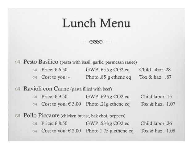
Figure 2: Final menu slide depicting numerical results in select economic, environmental, and social impacts. Note: Results were presented sequentially, with votes collected in-between the introduction of each new piece of information. No results were presented graphically to further challenge interpretation.

During voting, the participants realized that the activity was an illustrative exercise and that their votes had no bearing on the lunch provided, which may have resulted in decreased engagement. Nonetheless, the voting activity called attention to challenges faced in conducting LCSA, specifically regarding decision-maker integration of incommensurate and conflicting data, and fostered critical discussion regarding use of LCC and SLCA to broaden the scope of environmental LCA.