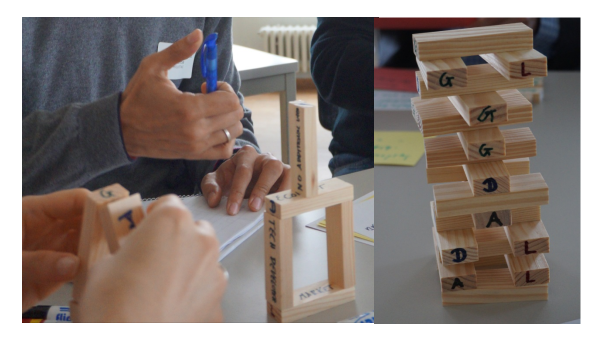
Figure 5 a) Participants creatively arrange blocks representing data, gaps, assumptions, and limitations into metaphorical LCA models, and b) the game ends when the tower falls or no more blocks can be removed.