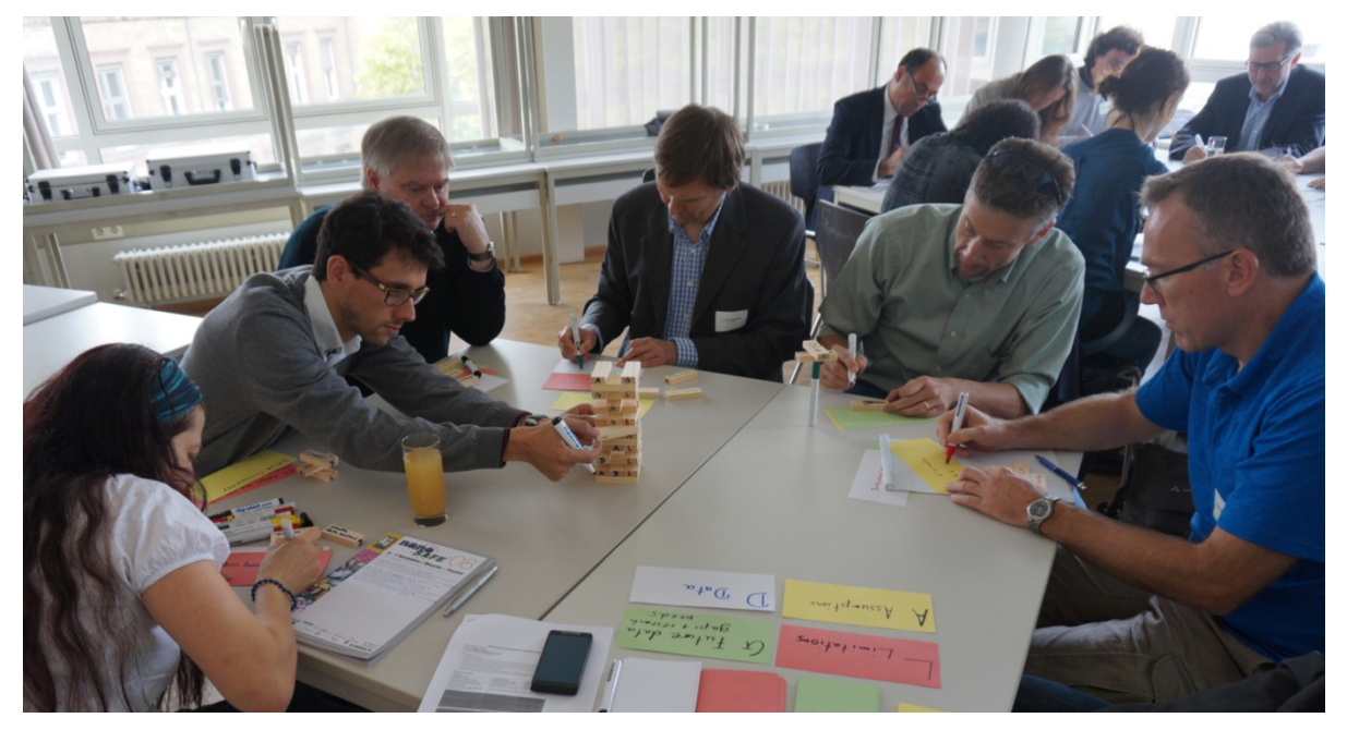
Figure 4: Participants build metaphorical towers representing a screening-type LCA of an emerging technology of their choice, and document the available data, modeling assumptions, knowledge gaps, and limitations encountered.

tower of ~5 blocks, shown in Figure 5a, play concluded when the tower collapsed or no more blocks could be removed as shown in Figure 5b. Participants then began in-session discussion by briefly presenting their models to one another in an attempt to identify similarities, differences, or opportunities to combine multiple models together.